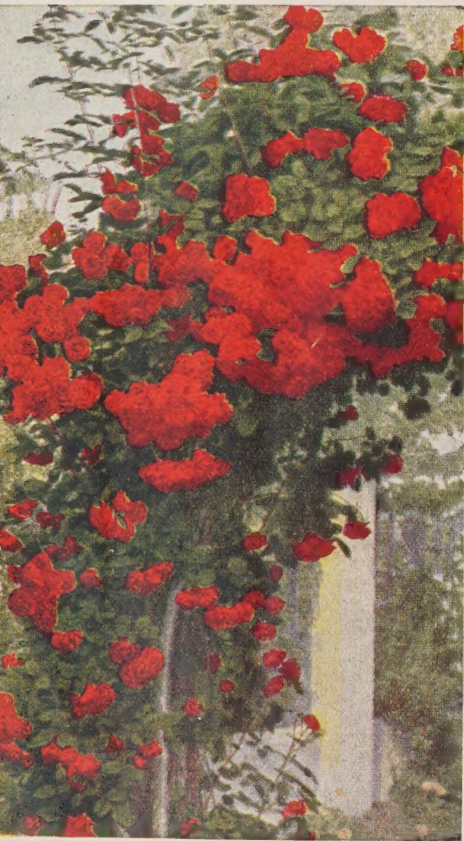
BLAZE (CLIMBER) (Plant Pat. No. 10)